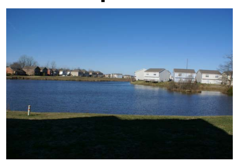
Rear View Of Loch Lane