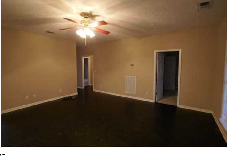
Den & Dining View