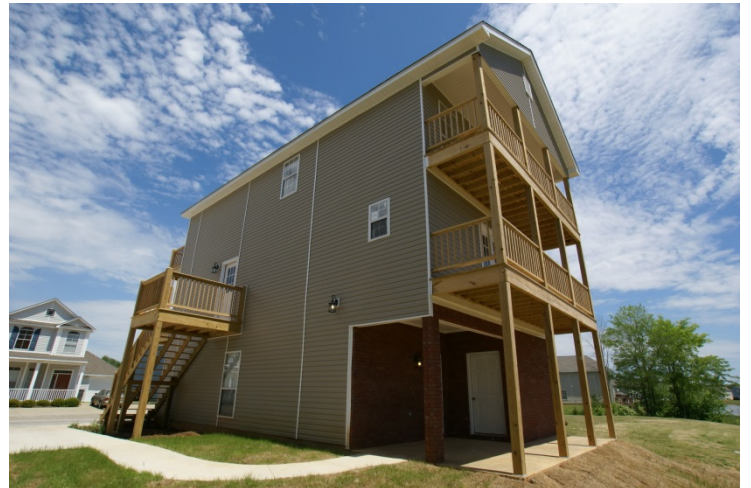
1 BR Entrance & Covered Patio