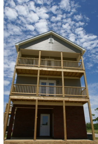
1 st Floor Entrance