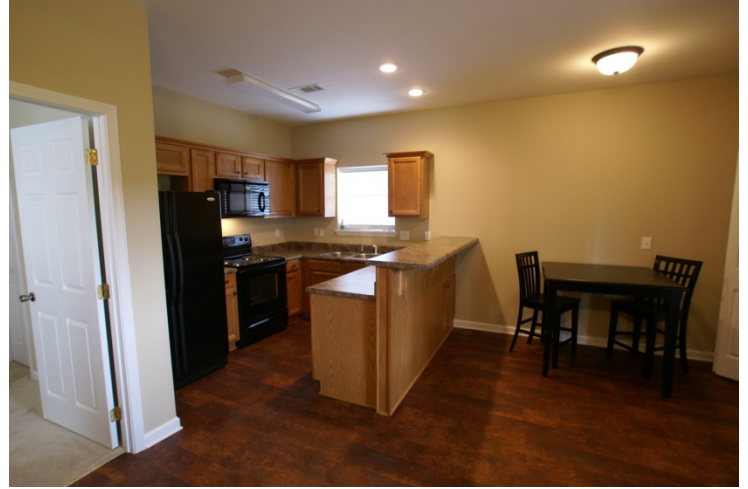
Kitchen & Dining Room Views