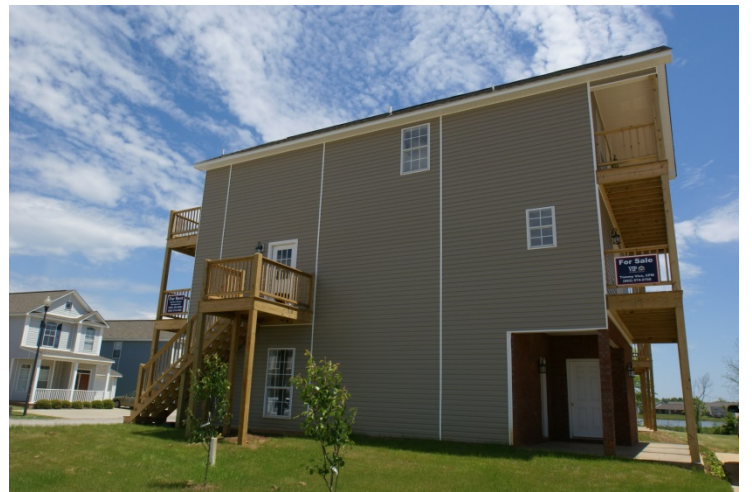
1 BR Entrance & Covered Patio