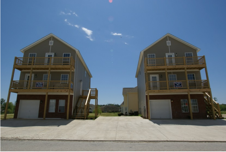
Duplex Front View