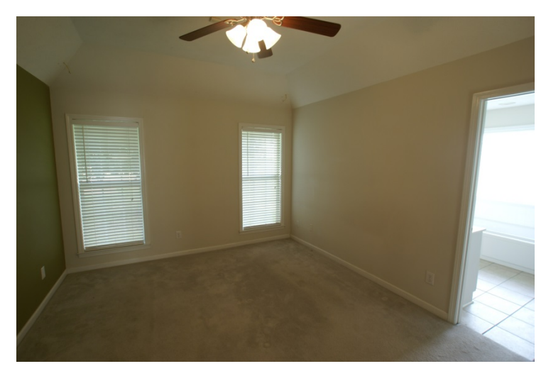
Master Bedroom Views