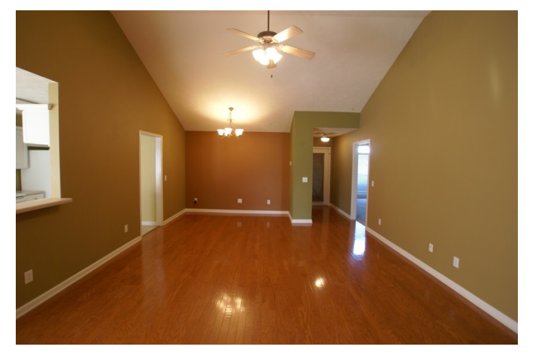
Den And Dining Area View