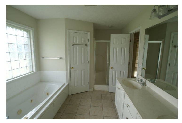
Master Bath Views