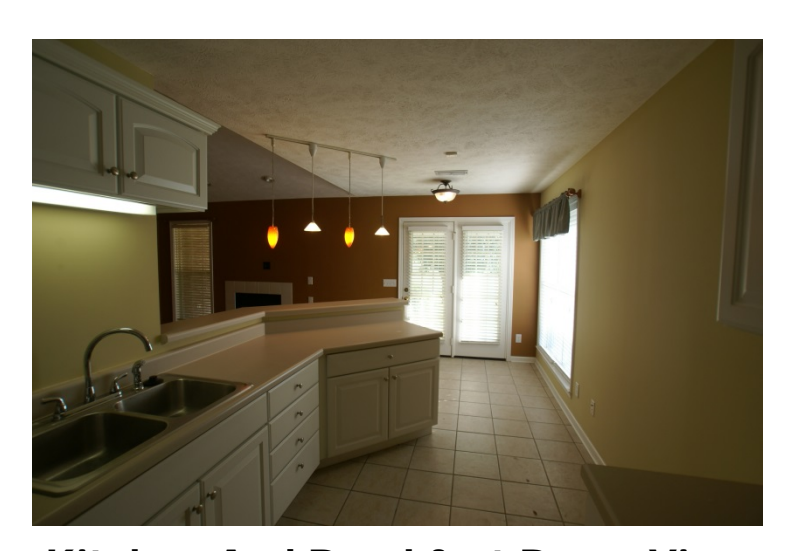
Kitchen And Breakfast Room View