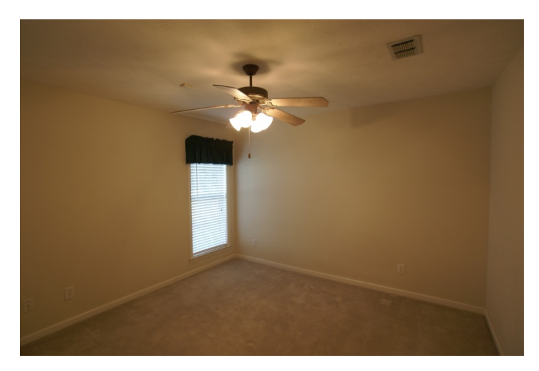
Bedroom #2 Views