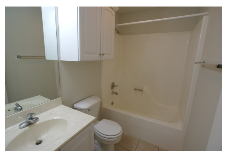
Bath #2 View