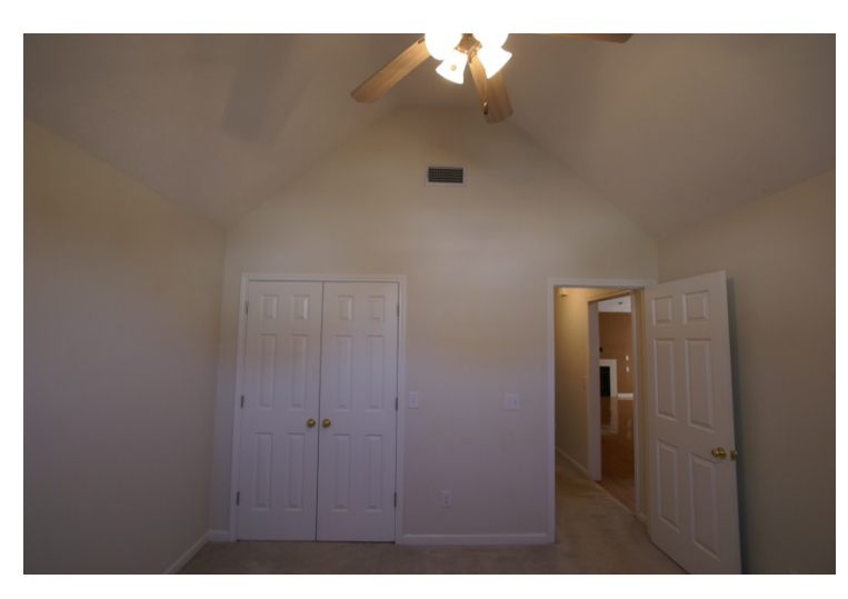
Bedroom #3 View