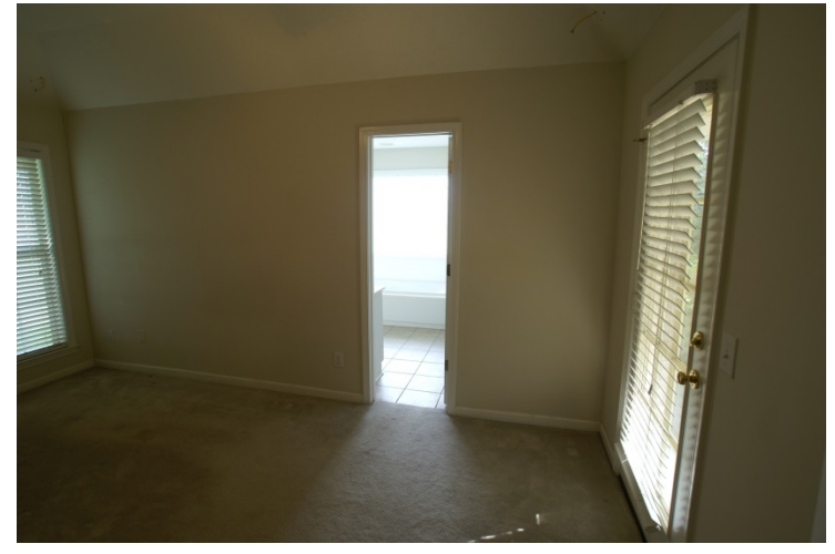
Master Bedroom Views