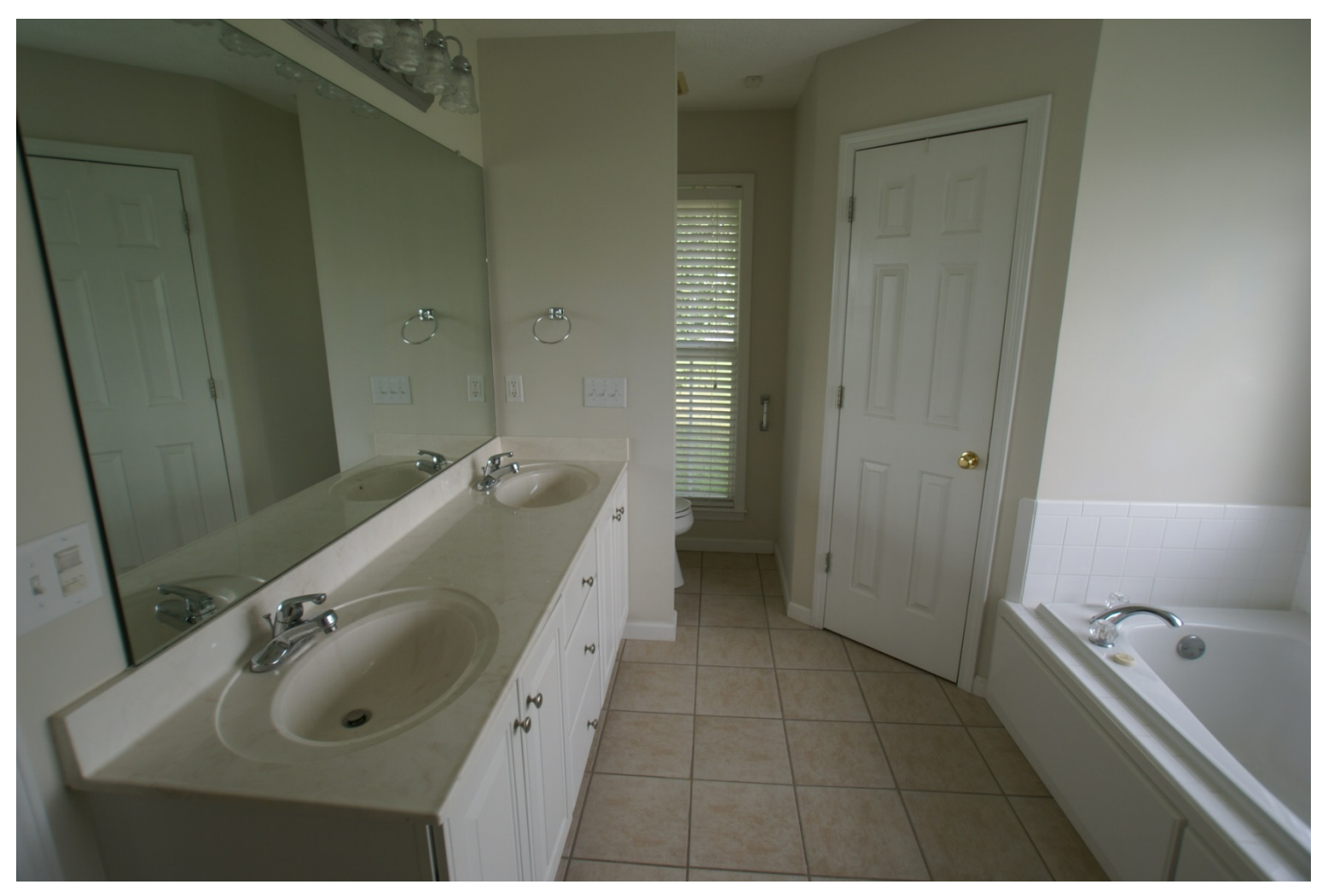
Master Bath View