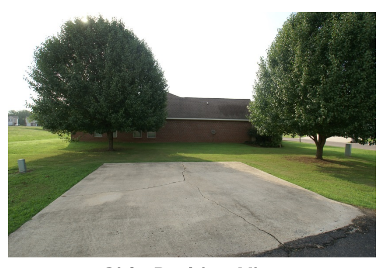
Side Parking View