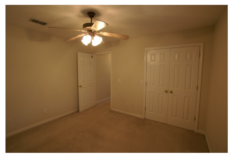
Bedroom #2 View