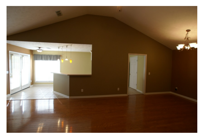
Den View Looking At Fireplace And Breakfast Room