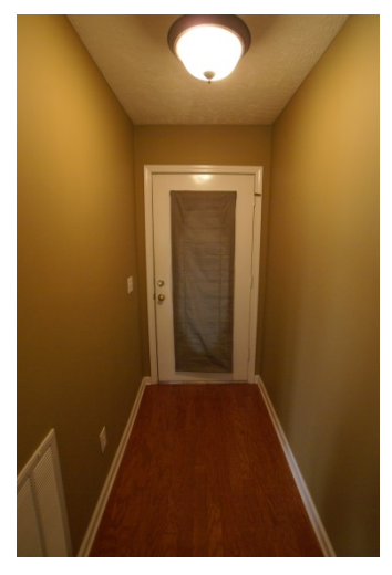
Front Entry Hall