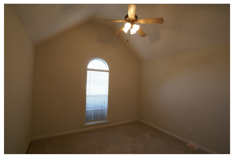
Bedroom #3 Views