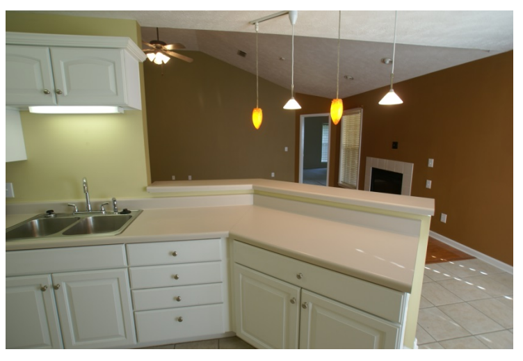
Kitchen Bar View Look At Den