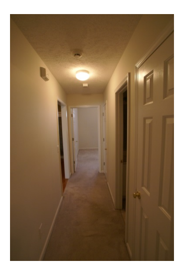
Bedroom #2 & #3 Hall