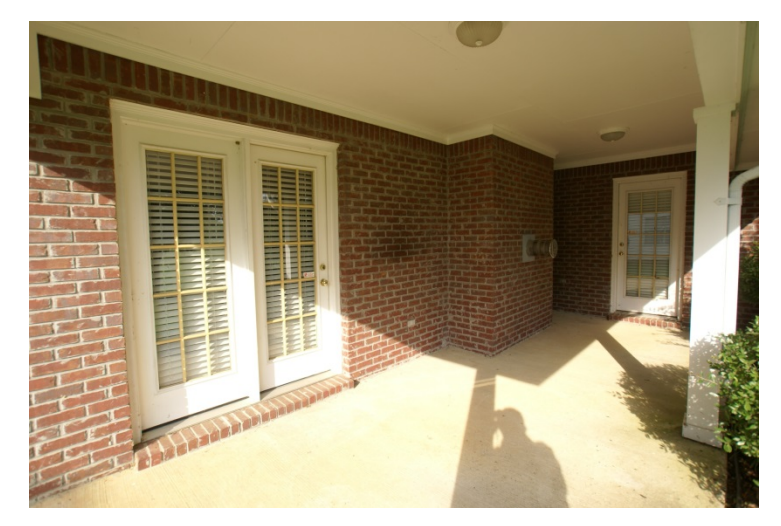
Rear Covered Patio Views