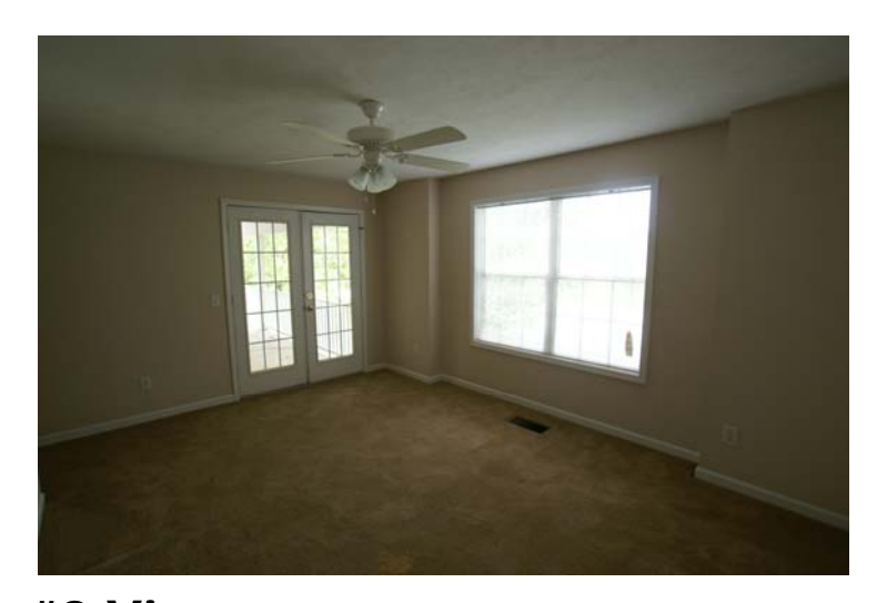
Bedroom #2 Views