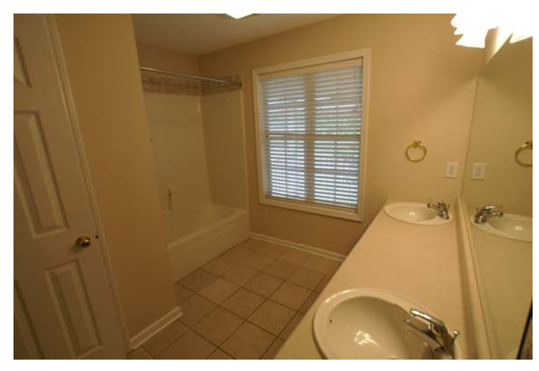
Bedroom # 3 Bath