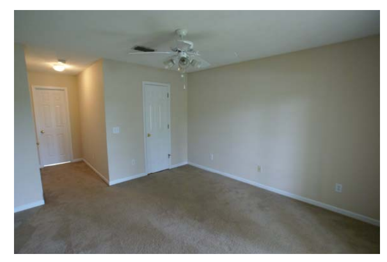
Bedroom #1 Views