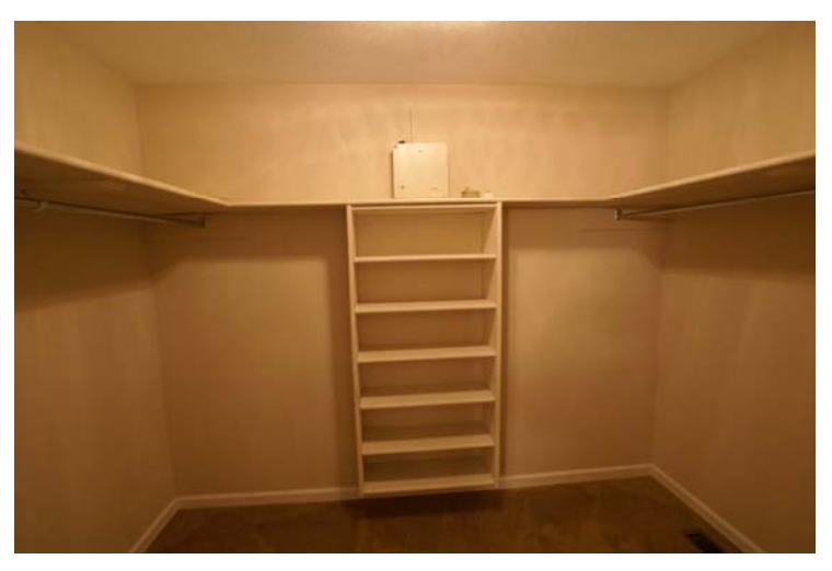
Bedroom #3 Walk-In Closet