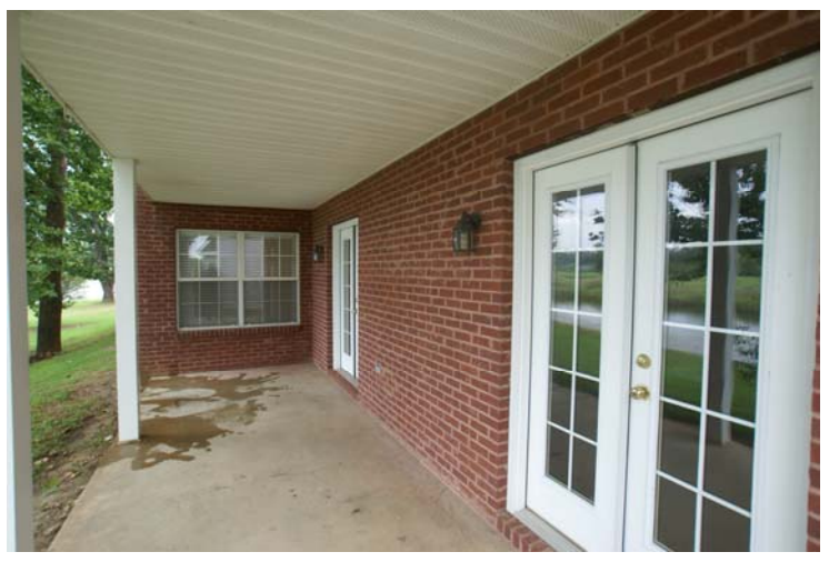
Covered Rear Porch