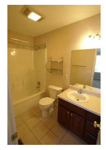
BR #2 Bath