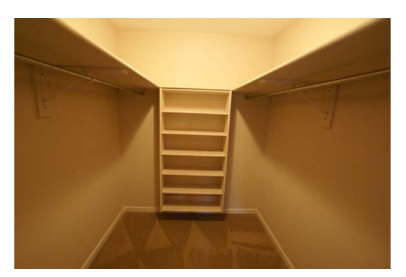
Bedroom #1 Walk-In Closet