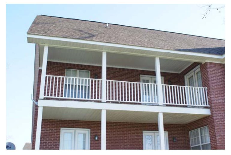
Rear Covered Porch & Balcony