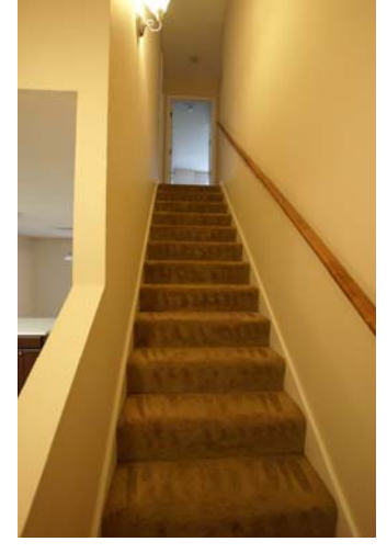
Front Entry & Stairs