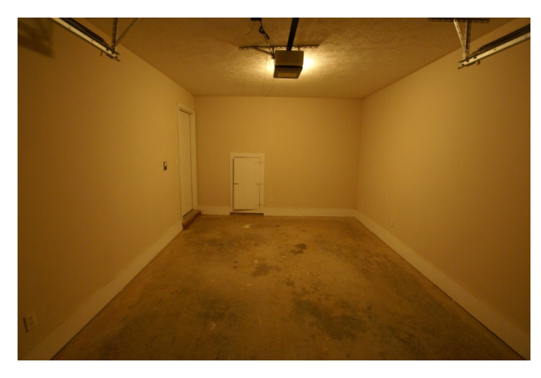
Single Car Garage