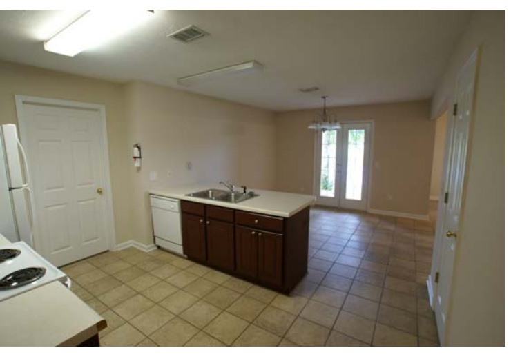
Kitchen Dining Room View