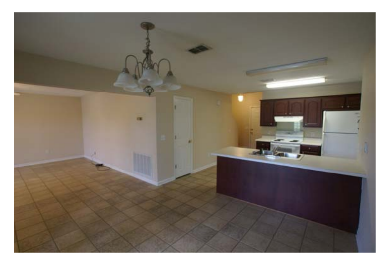
Kitchen & Den View