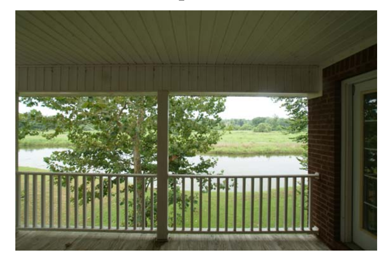
Covered Rear 2<sup>nd</sup> Floor Balcony Views