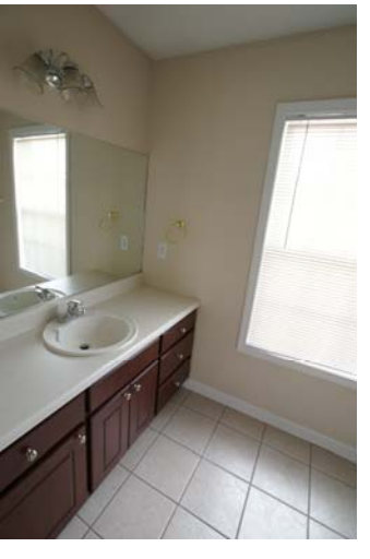
Bedroom #1 Bath Views