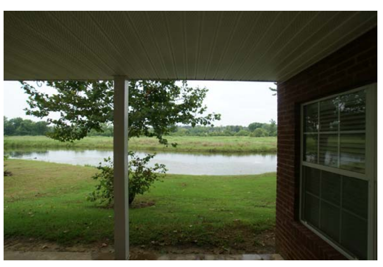
Covered Rear Porch View