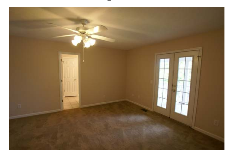
Bedroom #3 View