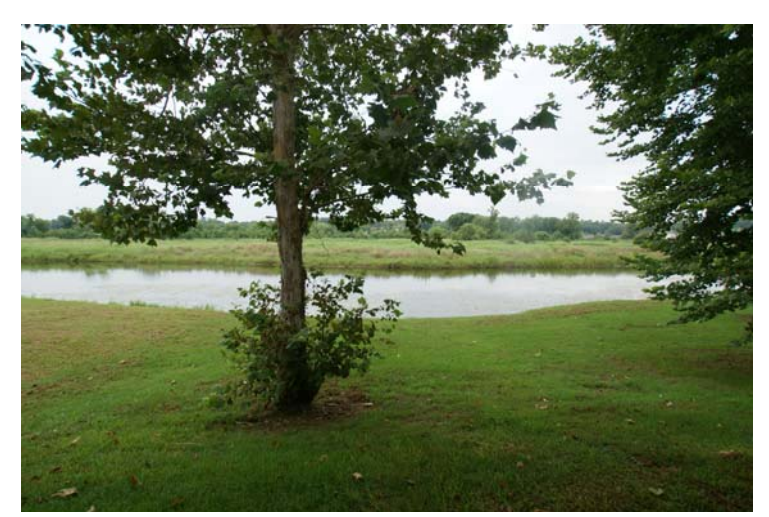
Rear Lake Views